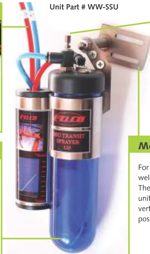
Unit Part # WW-SSU

For easy connection just cut the existing hose and plug the ends to the hose connectors. The unit is self-powered and uses gas flow only.