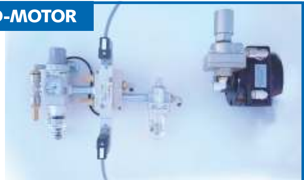
Item no. PFA-SK2