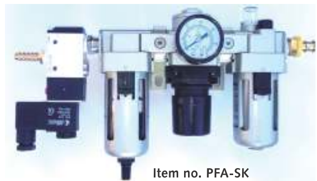
Item no. PFA-SK

The signal the solenoid uses can be connected parallel to the gas valve, or in case of SAW welding, parallel with the flux valve, in both cases the PFA will always be powered during welding.